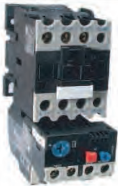
3 Pole + 1 N.O. Aux